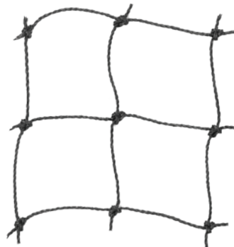
2" (75mm) Grid Size – Crows, Herons, Egrets